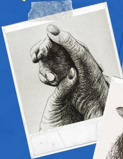
Drawings by Henry Moore