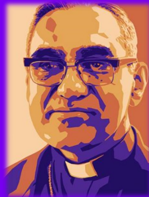
Saint Oscar Romero 15 August 1917-24 March 1980

Cardinal Wiseman Catholic School Part of The Romero Catholic Academy